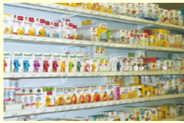
Drugs/ Vitamins/ Cranberries/ Grapefruit