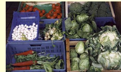
Some sorts of cabbage